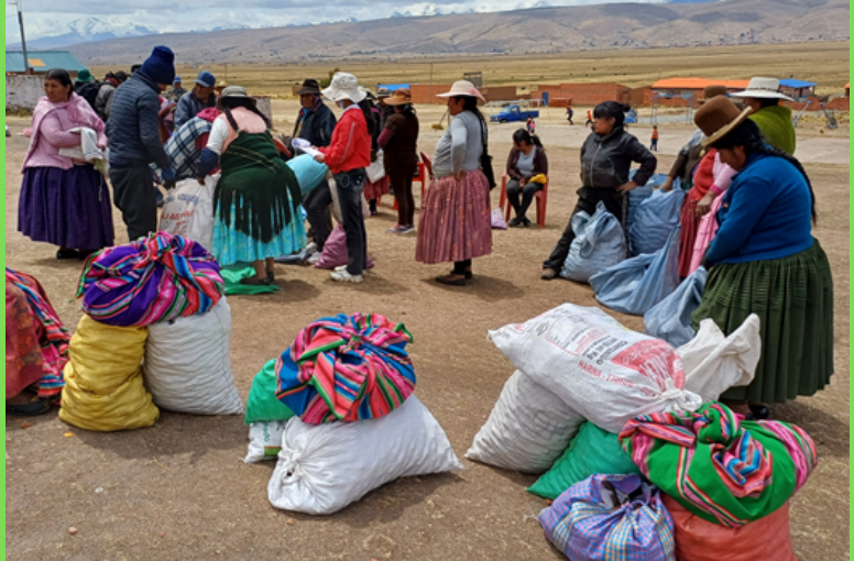
Families getting 125 pounds of seed potatoes