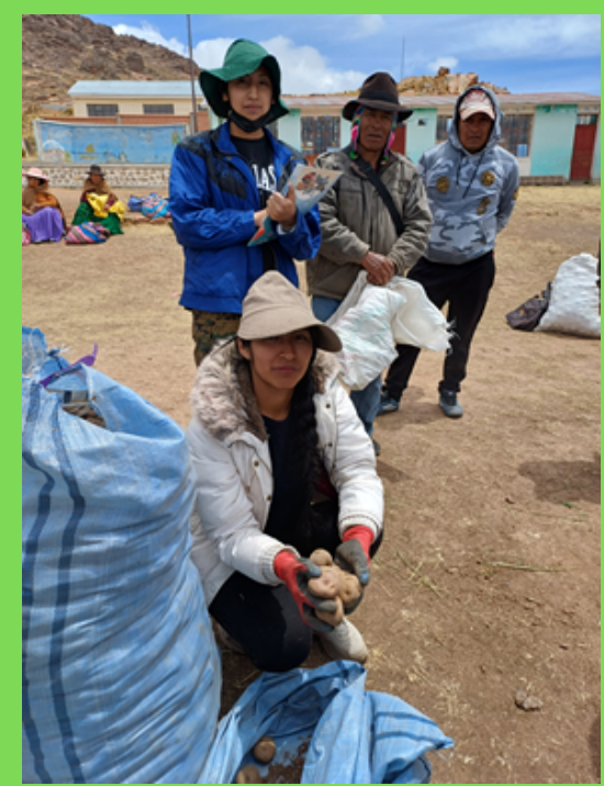
Young Friends distributing the seed potatoes