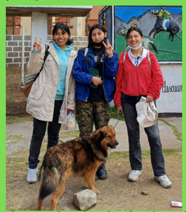
Volunteers after a long day of service work