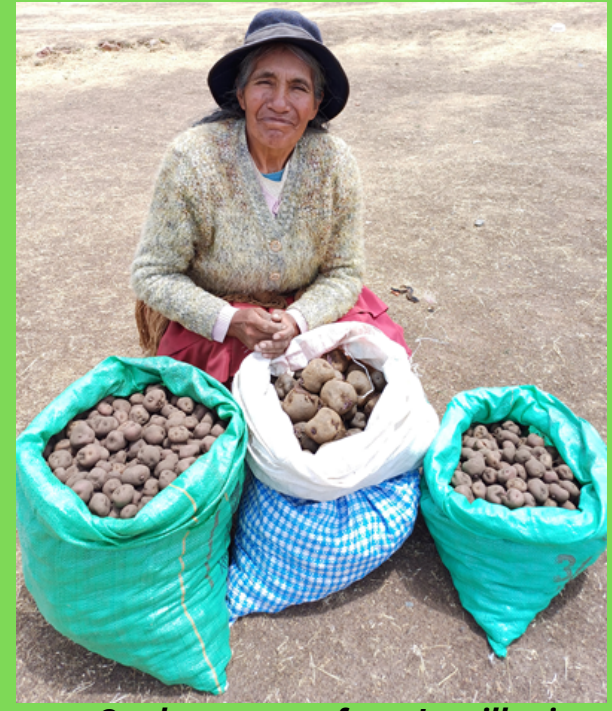
a Quaker woman from Isquillani